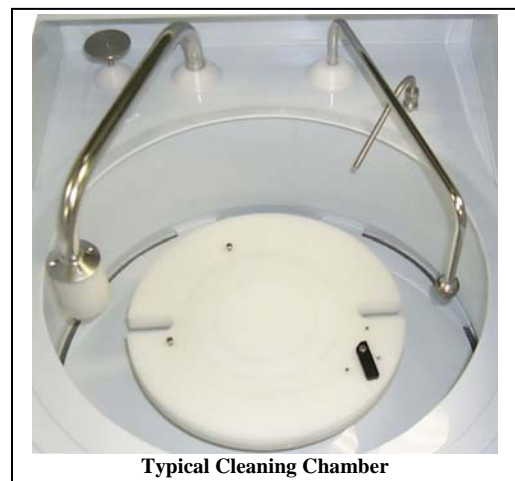
Typical Cleaning Chamber