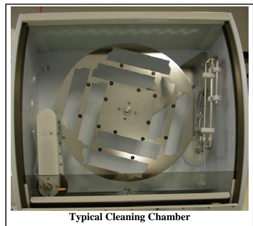
Typical Cleaning Chamber